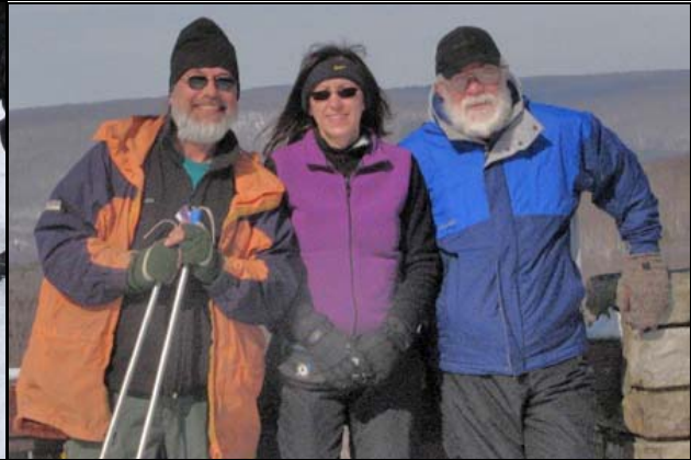
Alleghany State Park Trip 2009