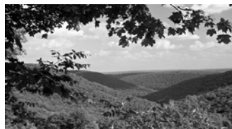
Water Tank Vista