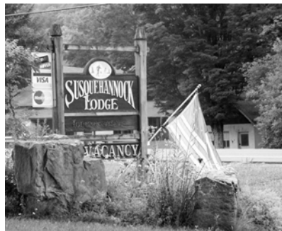
Enjoy a comfortable stay at the Susquehannock Lodge