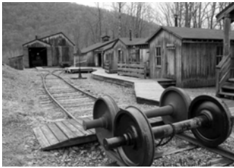
Pennsylvania Lumber Museum

Some of the KTA hikes will give members and visitors a chance to experience sections of the STS. The trail passes through two state parks, Ole Bull and Patterson, and ventures near Cherry Springs and Lyman Run state parks,