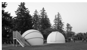
Cherry Springs Dark Sky Park