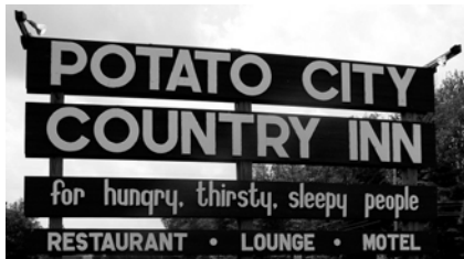
Hikers will receive a warm welcome at the Potato City Country Inn

Double occupancy rooms are available with queen size or two single beds, as well as lodging opportunities for groups of three or more.