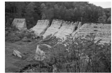
Austin Dam

These are only some of the adventures awaiting in Potter County. The Susquehannock Trail Club looks forward to hosting the hikes and welcoming KTA to a wonderful weekend of hiking in "God's Country."