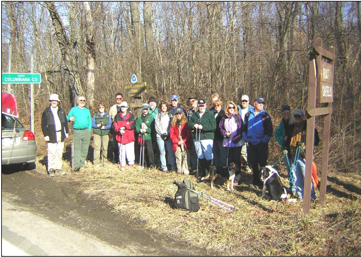
Tour de NCT of Pa Stage One Hike