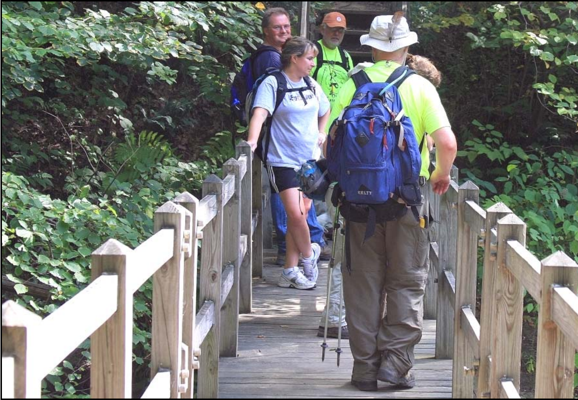
Tour de NCTA PA Stage 6 Hike through Moraine State Park