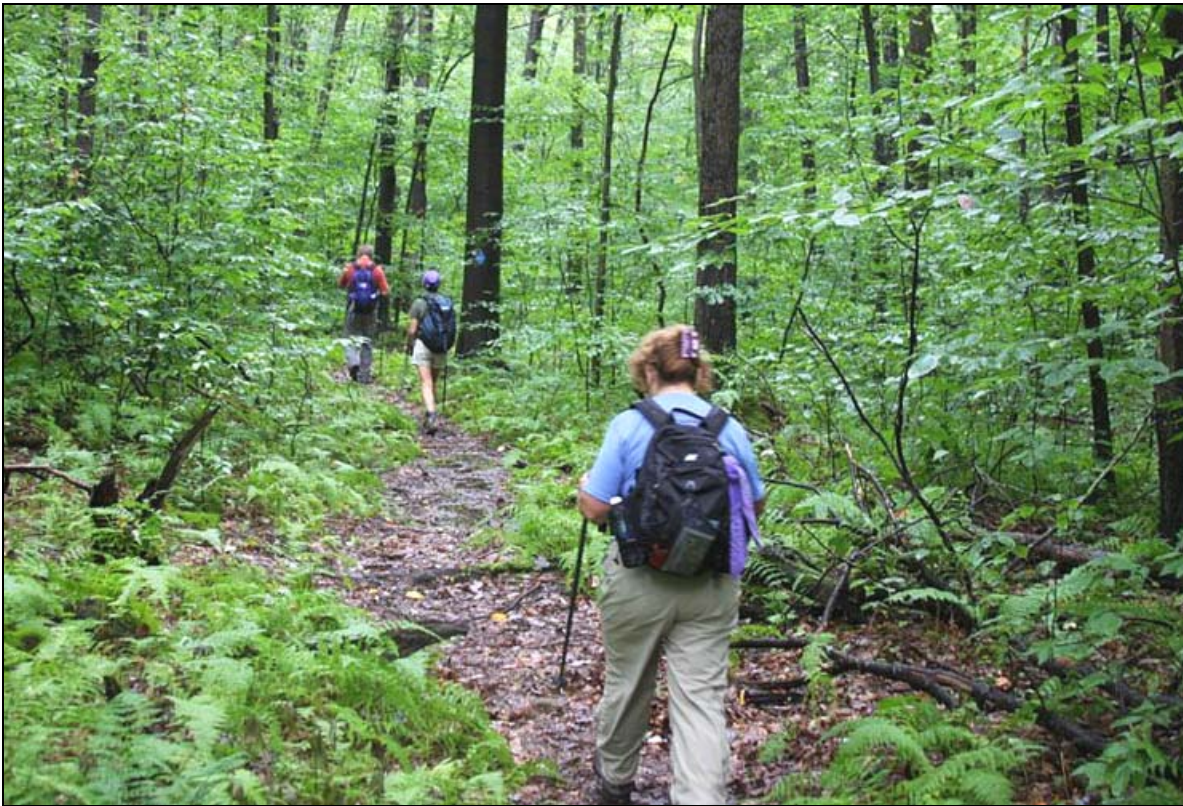
Tour de NCTA PA Stage 15 Minster Creek - Kelletville