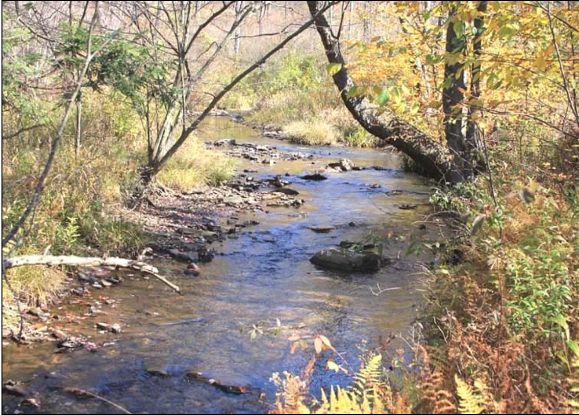
Scene from the Tour de NCTA PA Stage 17