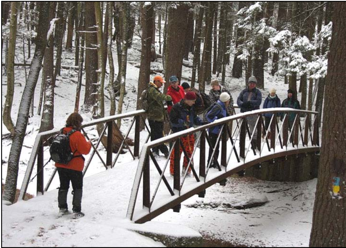
Tour de NCTA PA Stage 19