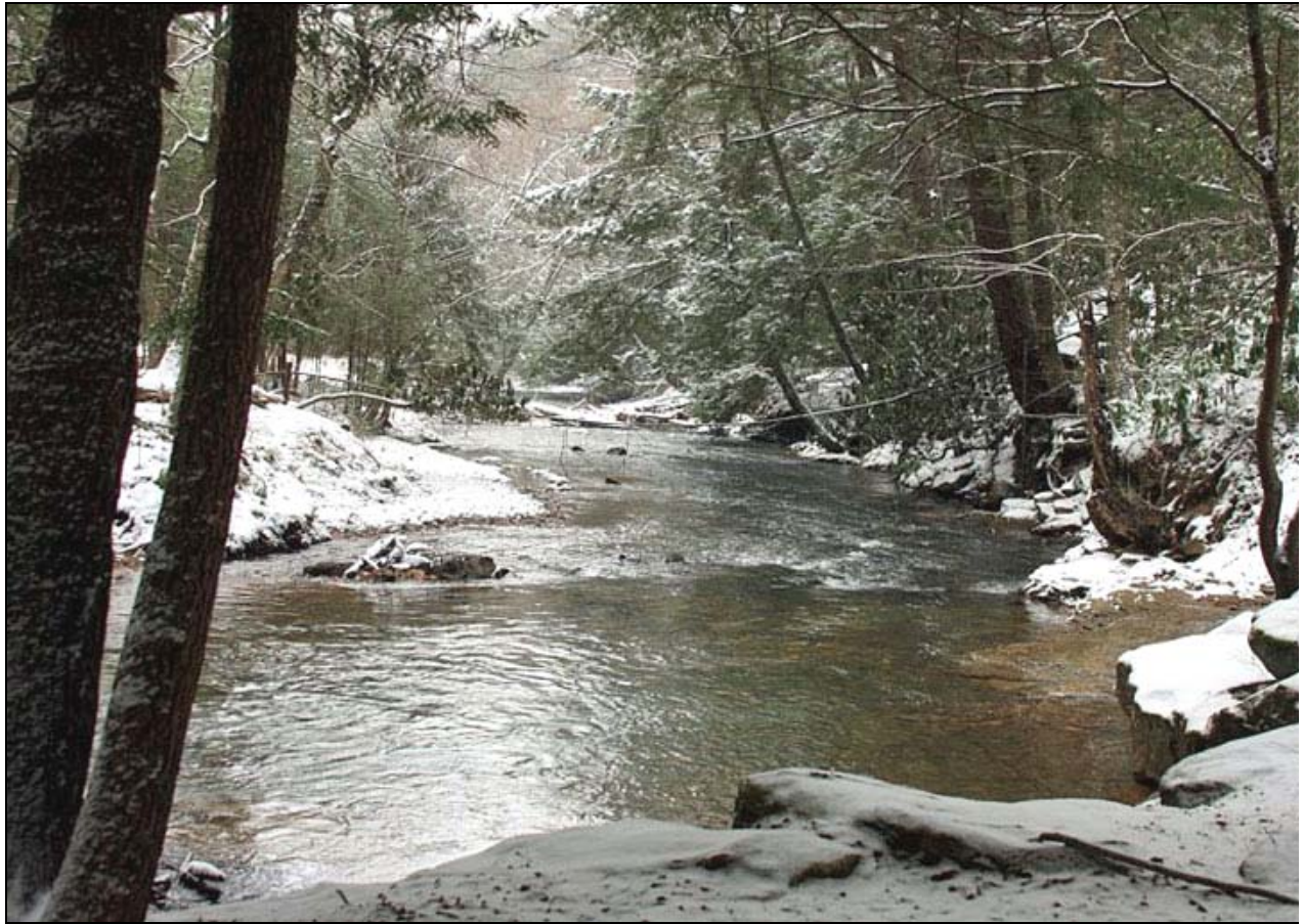
Tour de NCTA PA Stage 19