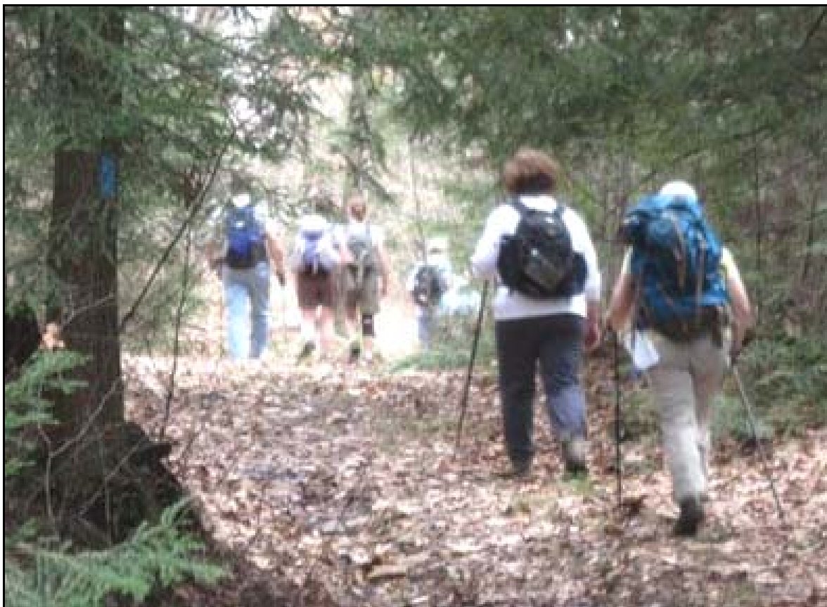
Tour de NCTA Stage 21