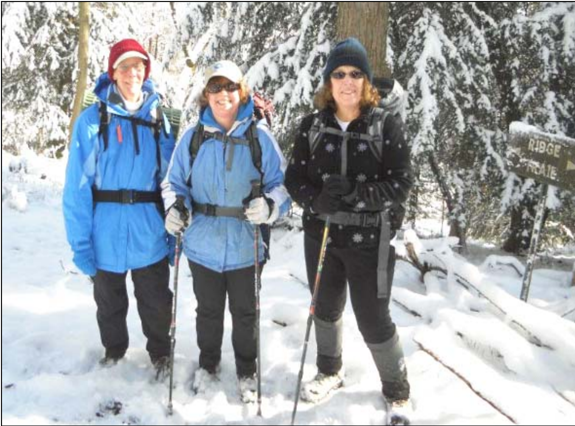
BOC Kennerdale Hike