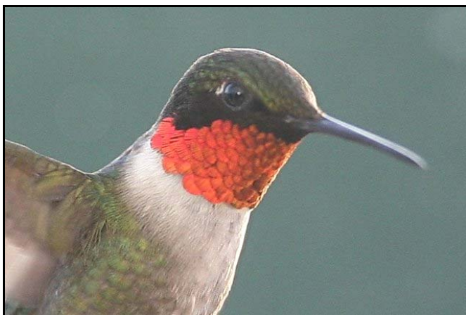
Ruby Throated Hummingbird