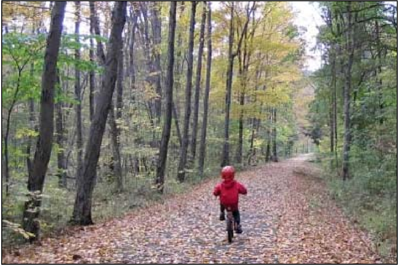
Oil Creek Train-Bike Ride