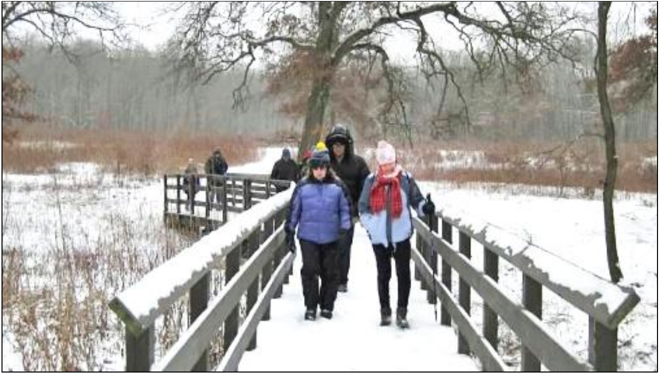
Groundhog Day Picnic Hike