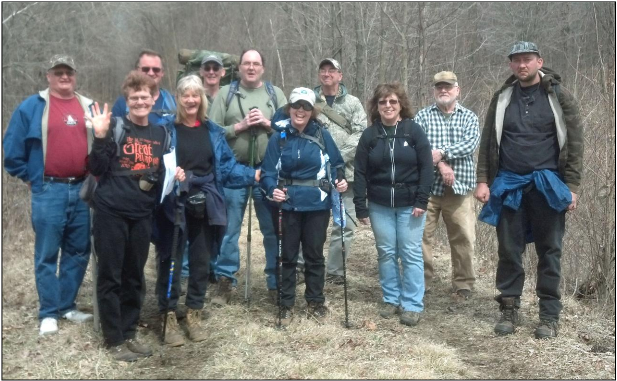
BOC Schollards Wetland Hike