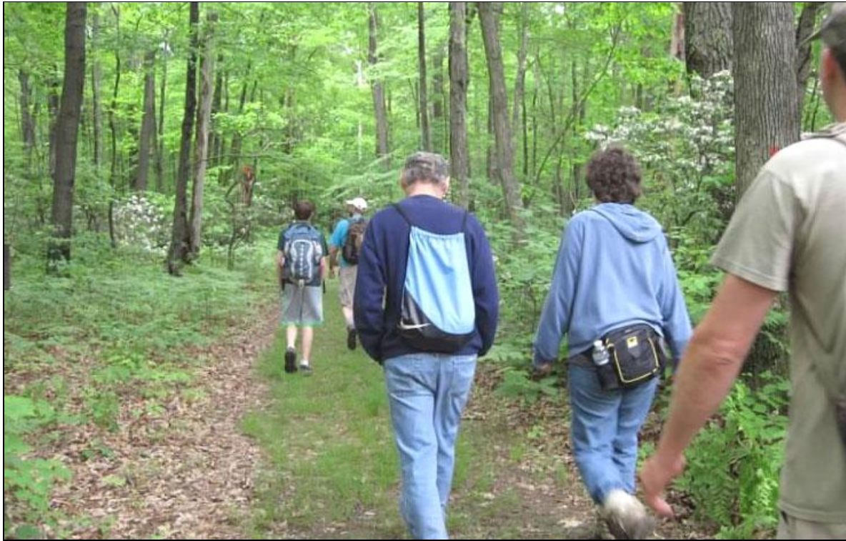
BOC Kennerdale Hike # 4