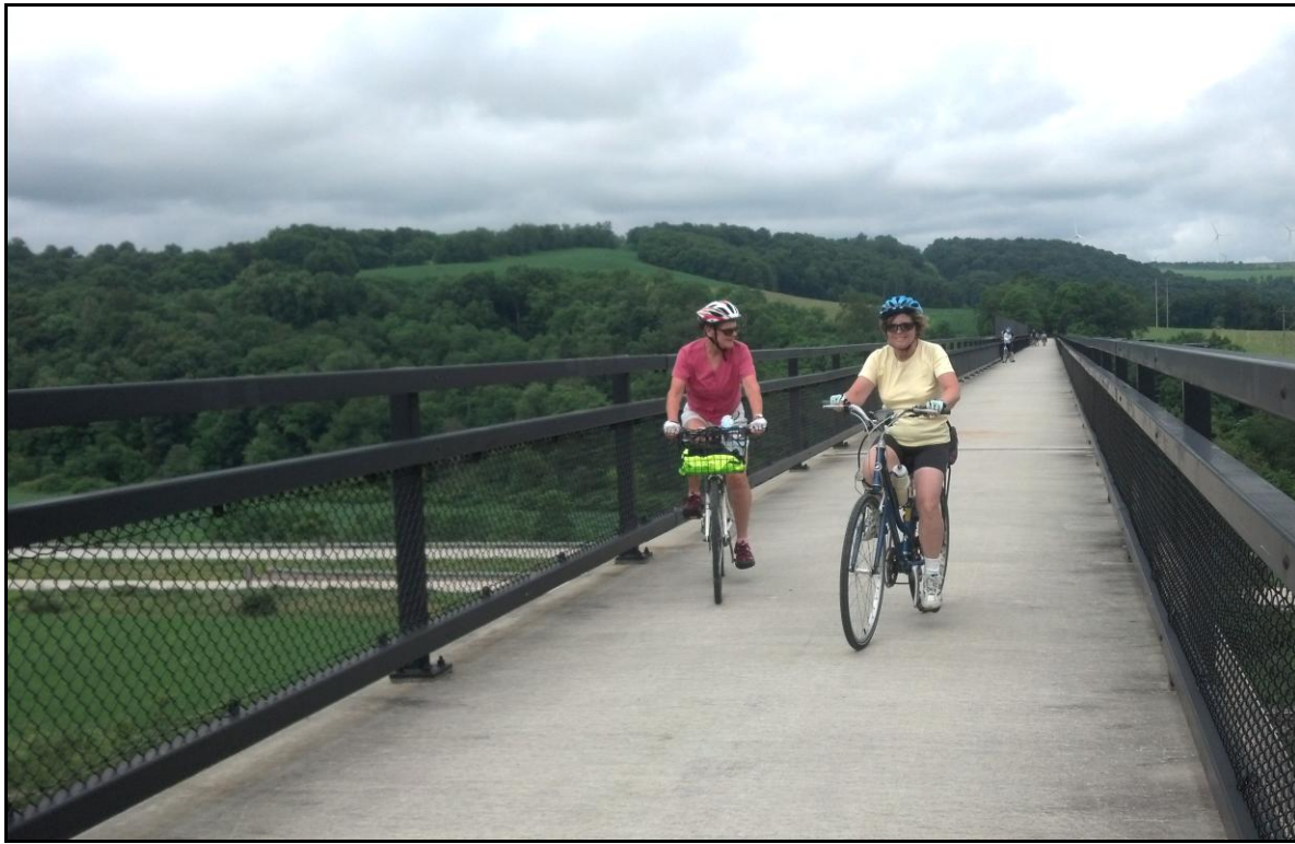
BOC Rockwood-Meyersdale Bike Ride