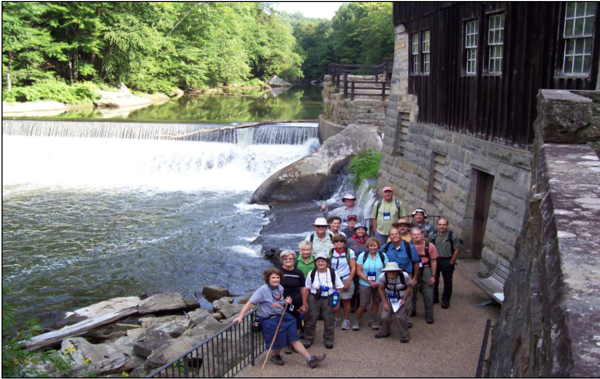
2013 Trailfest Hells Hollow Hike