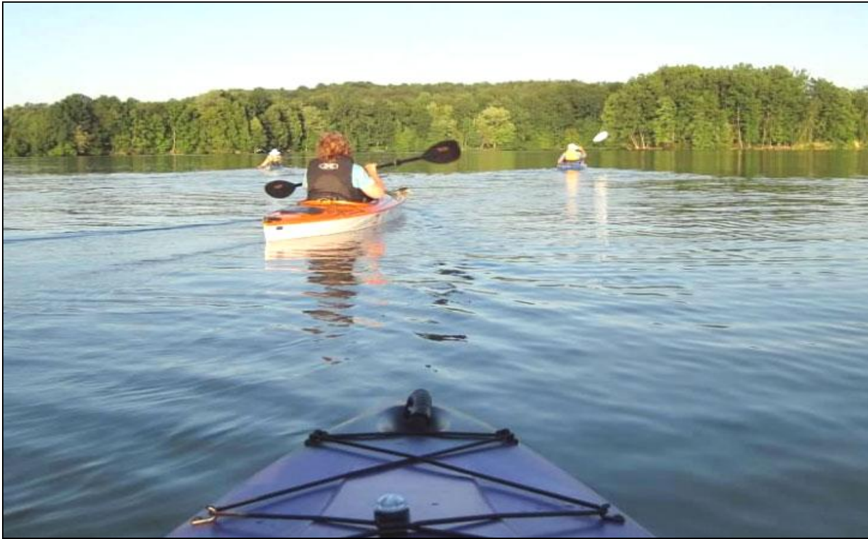
BOC Full Moon Paddle