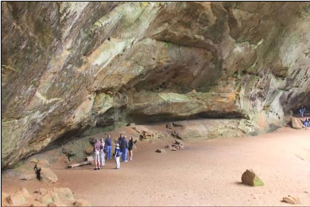
Hocking Hills State Park