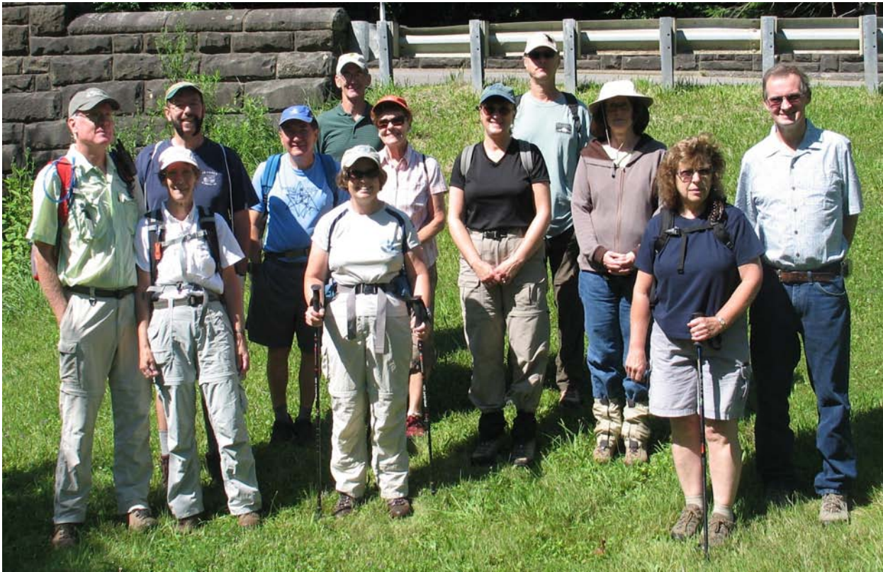
BOC hikers at Cook Forest on July 26, 2014