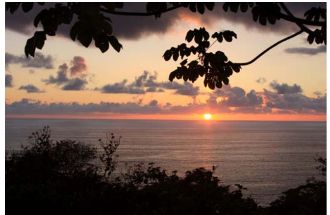
Costa Rican Sunset