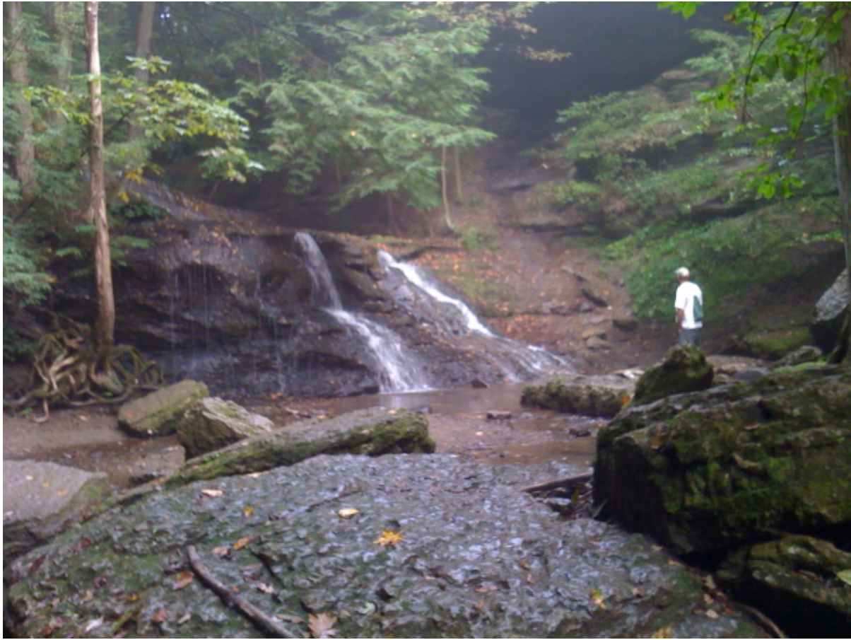
photo from BOC hike on September 21